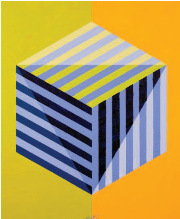
MODERN - CONSTRUCTIVISM