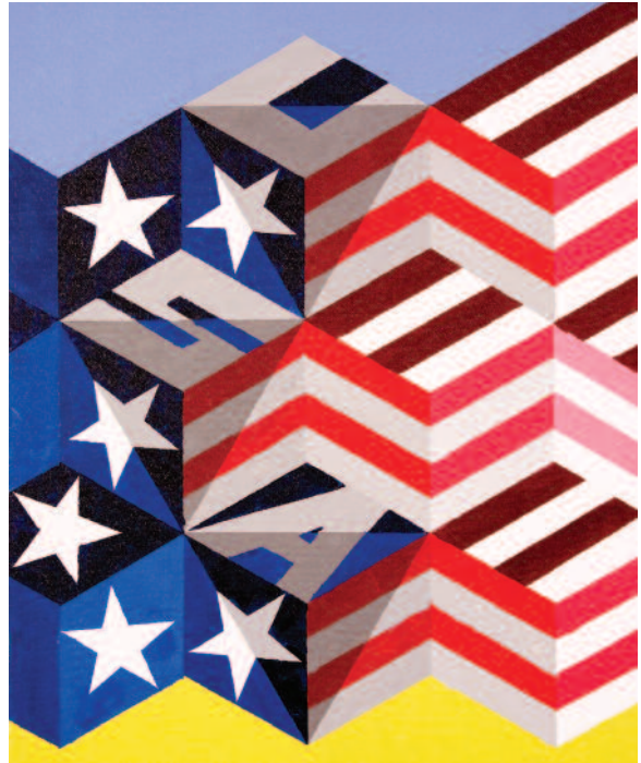
ART IS NOT BLIND

website: www.sitkiart.com by appointment